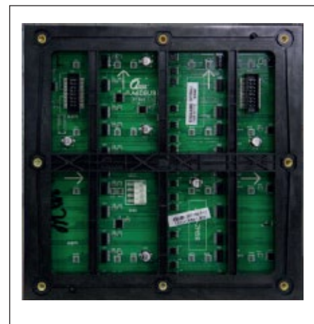
P6 Rear View