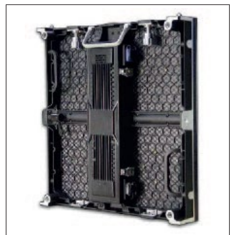
P5 Rear View