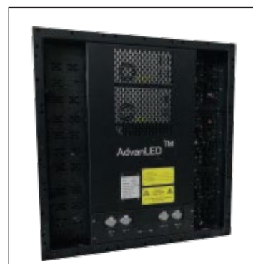
P5 Rear View