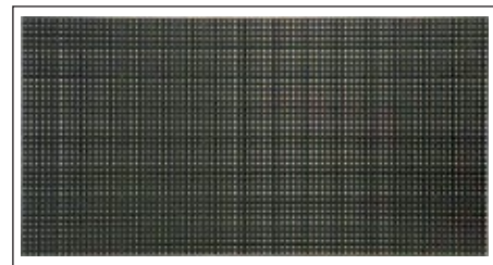
P16 Front View