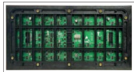
P16 Rear View